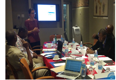
Sierra Leone, September 2017