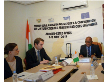
Côte d'Ivoire, Nov 2017