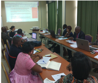
Cameroon, March 2018