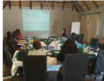
Malawi, March 2018